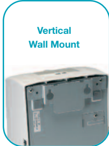
Vertical Wall Mount