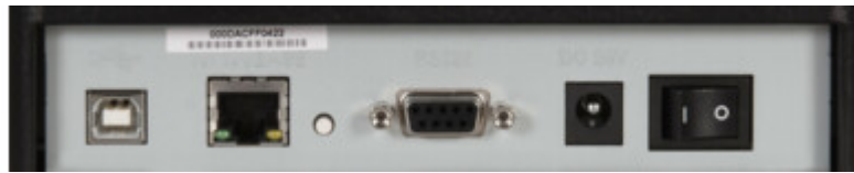
Ethernet LAN, USB and Serial interfaces as standard